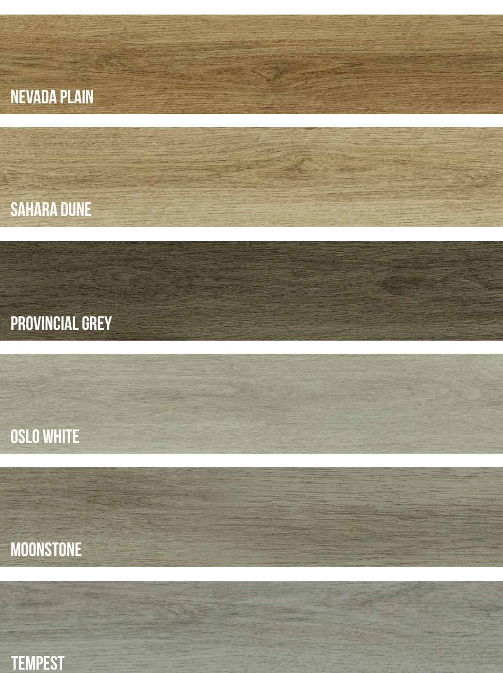
*colours may vary

With an array of sophisticated colours, our Natural Oak Range provides a neutral base that will complement a variety of colour schemes.